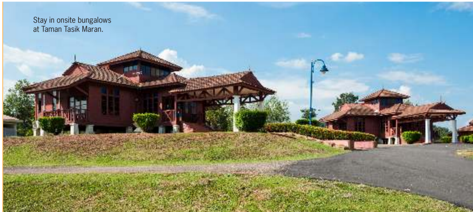
Stay in onsite bungalows at Taman Tasik Maran.