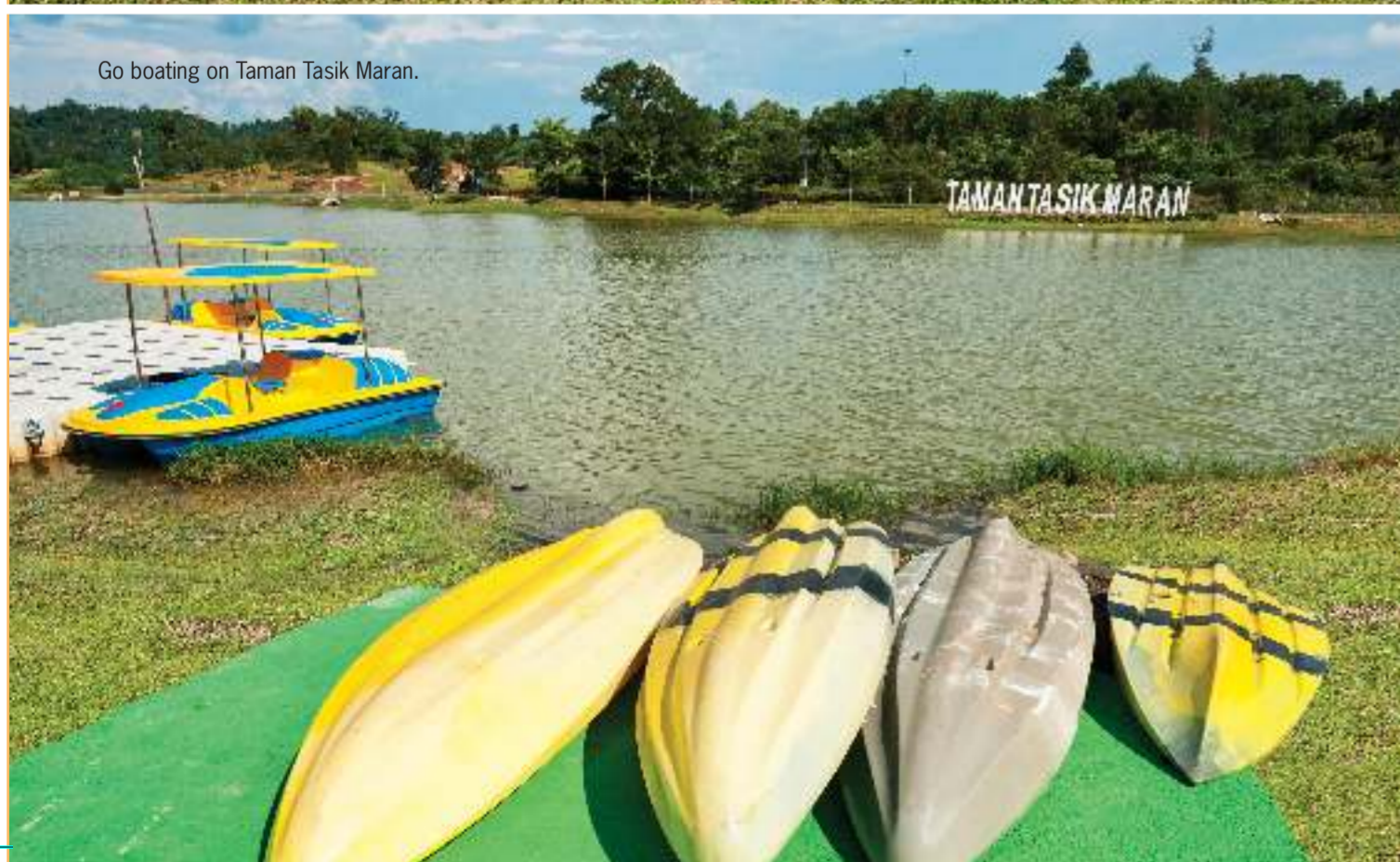
Go boating on Taman Tasik Maran.

Sri Marathandavar Aalayam Temple is important to Hindus who visit to perform prayers, especially during the Panguni Uthiram Festival. This temple is located in a remote agricultural district and a sacred tree is preserved in the temple's inner sanctum. Panguni Uthiram Festival marks the last month of the Tamil calendar and it attracts over 450,000 worshippers annually.