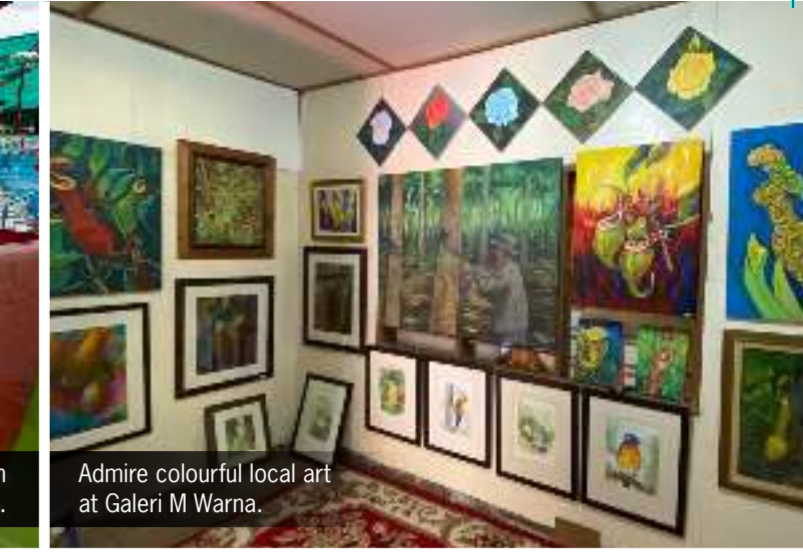
Admire colourful local art at Galeri M Warna.