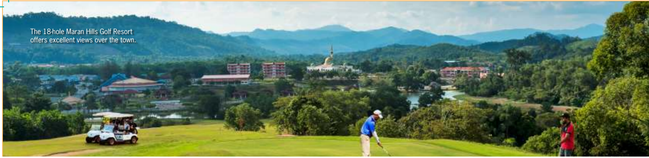
The 18-hole Maran Hills Golf Resort offers excellent views over the town.