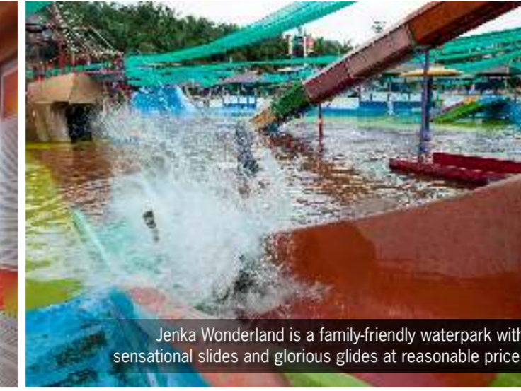
Jenka Wonderland is a family-friendly waterpark with sensational slides and glorious glides at reasonable price.