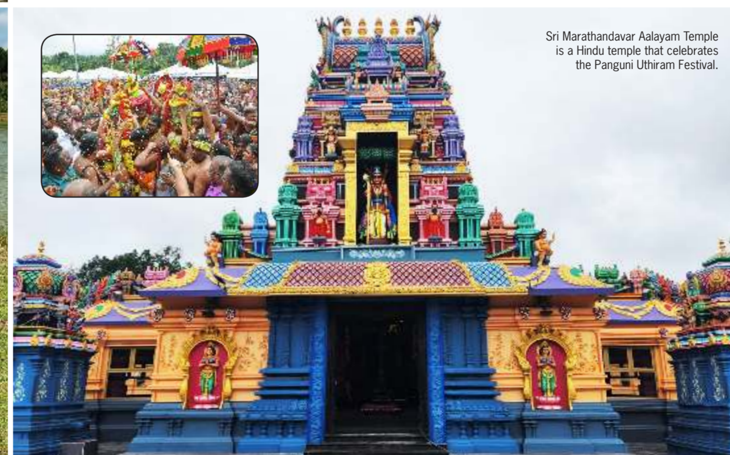
Sri Marathandavar Aalayam Temple is a Hindu temple that celebrates the Panguni Uthiram Festival.