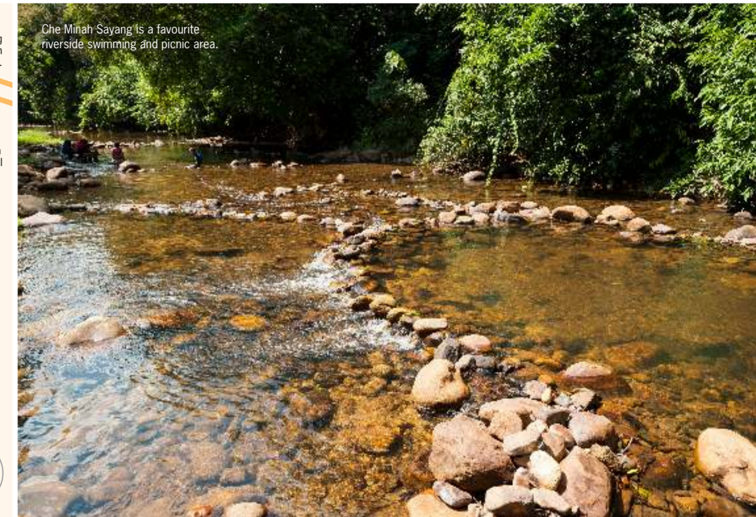
Che Minah Sayang is a favourite riverside swimming and picnic area.