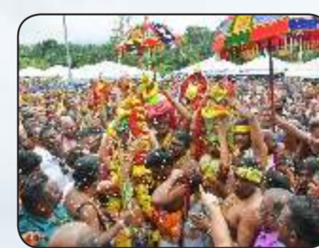
Sri Marathandavar Aalayam Temple is a Hindu temple that celebrates the Panguni Uthiram Festival.